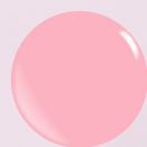
Sweet Pink 4012211