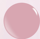
Baby Boom 4012207