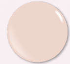
Cover Cream 4020764