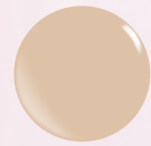
Soft Beige 4012210