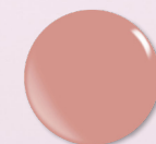
Summer Sweet 4012205