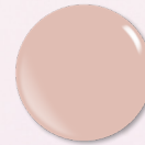
Strawberry Cream 4012201