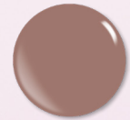
Cover Tan 4020768