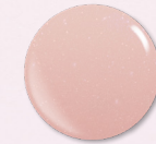
Shimmer Peach Puff 4020763