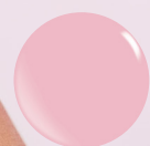
Pink Cloud 4012203