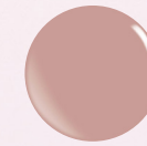
Pale Pink 4012208