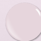
Mauve Rose 4012212