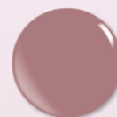
Cover Pink 4012209