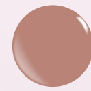
Soft Maroon 4012204