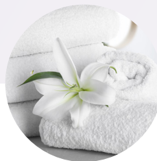
FRESH & CLEAN